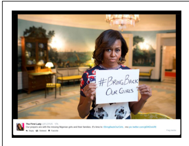
Figure 4. Tweeted handwritten sign-holding

illustrations of how very short documents, which are assemblages of paper (medium) and handwriting (mode), migrate into and are displayed – assume performativity and agency – in digital environments.