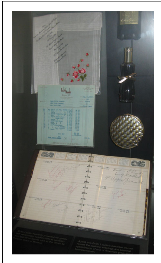
Figure 1. Handwriting on display: Estée Lauder's executive planner

The museum label reads: 'A peek into Estée Lauder's executive planner reveals the business meetings and personal appointments of one of America's prominent businesswomen'. The label fulfils the capacity of telling, which frames the showing (artifacts) by directing the audience's gaze and suggesting what the showing is about. The word 'peek' is key, because it establishes a particular gaze or way of looking – a suggested mode of visual consumption. Typically of museum artifacts, the planner was not initially intended for display, hence its showing positions audiences as voyeurs. The planner, which fulfilled its function in the 1980s, in its 'first life', now reappears and re-functions in its 'second life' as display that publicly indexes American Jewish history (Kirshenblatt-Gimblett, 1998). The act of peeking emphasizes the distinction between the document's first life, which is private, and its second life, which is public, it also emphasizes the distinction between the celebrity ('prominent') who used it, and the lay museum audiences, who consume it.