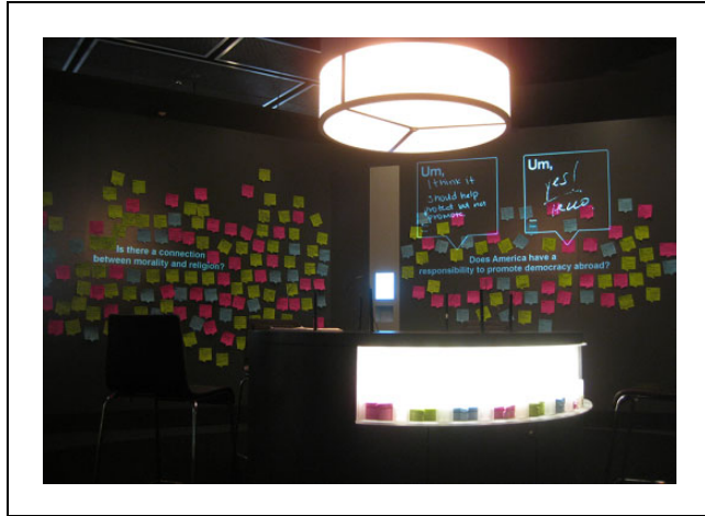
Figure 3. Interactive: 'Join in and lend your voice!'

questions captured in Figure 3 are Is there a connection between Morality and Religion? (left) and Does America have a responsibility to promote democracy abroad? (right).